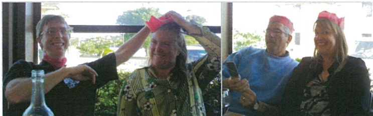
Below: MST & PC Christmas Dinner at the Pier Hotel George Town