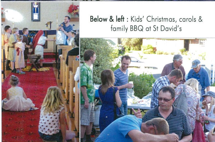
Below & left : Kids' Christmas, carols & family BBQ at St David's